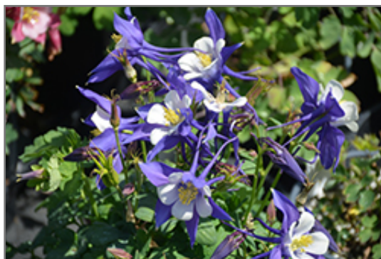
Kirigami Deep Blue and White Columbine flowers