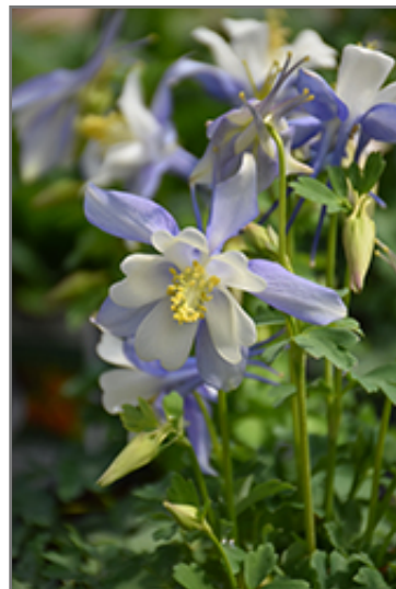
Kirigami Deep Blue and White Columbine flowers

This is a relatively low maintenance plant, and should be cut back in late fall in preparation for winter. Deer don't particularly care for this plant and will usually leave it alone in favor of tastier treats. Gardeners should be aware of the following characteristic(s) that may warrant special consideration;