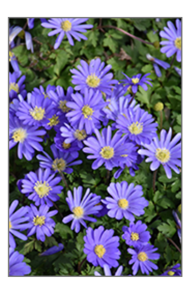
Blue Star Windflower flowers

This variety produces a lovely, low growing mat of intense blue daisy flowers in spring, when little else blooms; attractive, finely cut leaves disappear soon after flowering; requires dry dormancy after blooming and prefers sandy soil