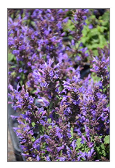
Sunrise Blue Hyssop flowers

Tall spikes of rich lavender-purple flowers with pink calyxes held above compact mounds of gray-green, licorice scented foliage; attracts pollinators to the garden