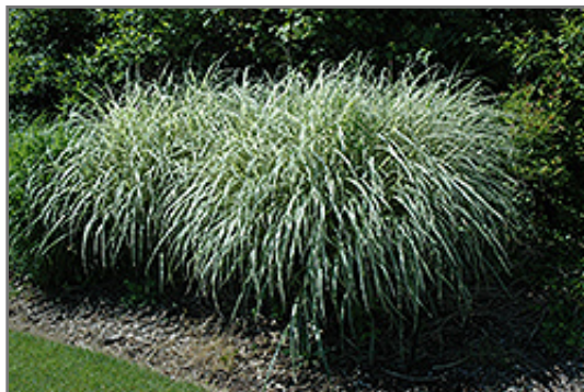
Rigoletto Maiden Grass