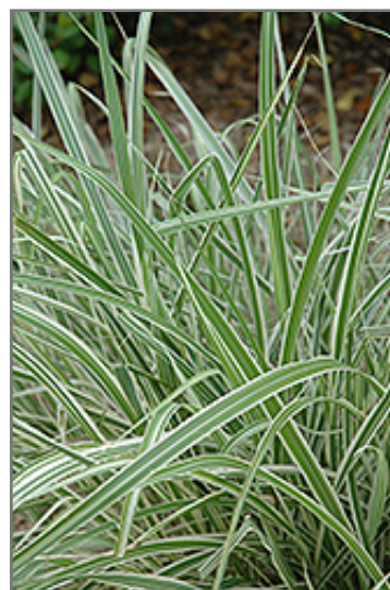
Rigoletto Maiden Grass foliage