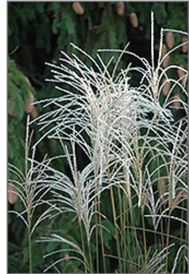
Graziella Maiden Grass fruit