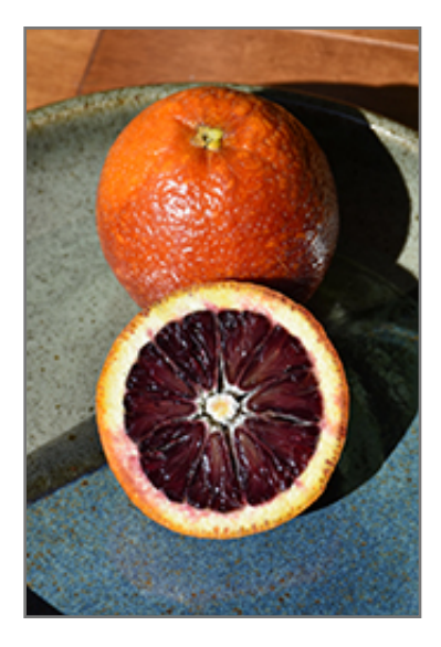
Tarocco Blood Orange fruit

Tarocco Blood Orange features showy clusters of fragrant white star-shaped flowers at the ends of the branches from late winter to early spring. It has dark green evergreen foliage. The glossy oval leaves remain dark green throughout the winter. It features an abundance of magnificent orange berries with pink blush from late fall to late winter.