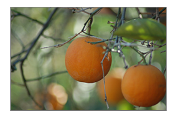
Tarocco Blood Orange fruit