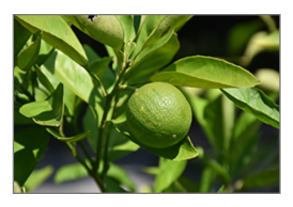
MidKnight Valencia Orange fruit

An attractive, rounded tree with large leaves, producing medium to large, seedless fruit that is very sweet; may be difficult to peel, so it is ideal for juicing; a nice landscape plant, or large screen; protect from frost; great for containers