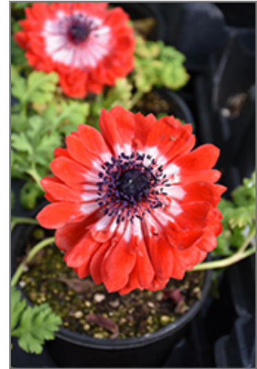
Harmony Double Scarlet Anemone flowers