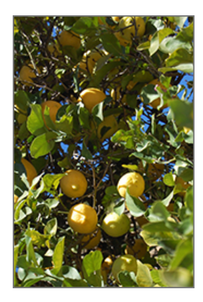
Lemon fruit