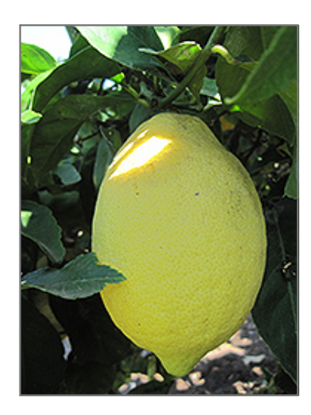
Lemon fruit