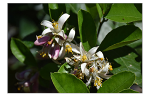
Lemon flowers

This is a multi-stemmed evergreen tree with an upright spreading habit of growth. Its average texture blends into the landscape, but can be balanced by one or two finer or coarser trees or shrubs for an effective composition. This is a relatively low maintenance plant, and is best pruned in late winter once the threat of extreme cold has passed. It is a good choice for attracting birds, bees and butterflies to your yard. Gardeners should be aware of the following characteristic(s) that may warrant special consideration: