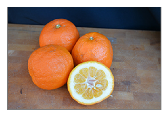
Consolei Bitter Orange fruit and flesh

This is a relatively low maintenance tree, and is best pruned in late winter once the threat of extreme cold has passed. It is a good choice for attracting birds, bees and butterflies to your yard. It has no significant negative characteristics.