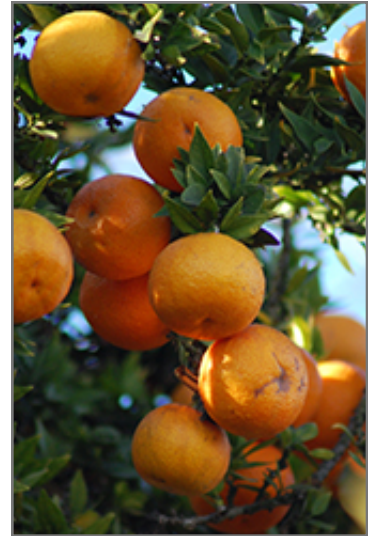
Chinotto Myrtle-leaved Orange fruit

Chinotto Myrtle-leaved Orange is a multi-stemmed evergreen tree with an upright spreading habit of growth. Its average texture blends into the landscape, but can be balanced by one or two finer or coarser trees or shrubs for an effective composition.