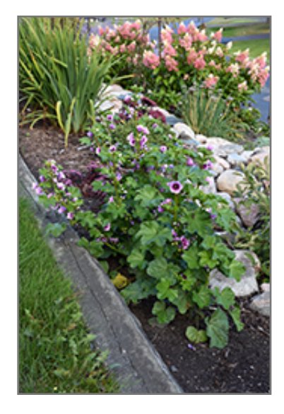
Zebrina Mallow in bloom

This plant should only be grown in full sunlight. It does best in average to evenly moist conditions, but will not tolerate standing water. It is not particular as to soil type or pH. It is highly tolerant of urban pollution and will even thrive in inner city environments. Consider applying a thick mulch around the root zone in winter to protect it in exposed locations or colder microclimates. This is a selected variety of a species not originally from North America.