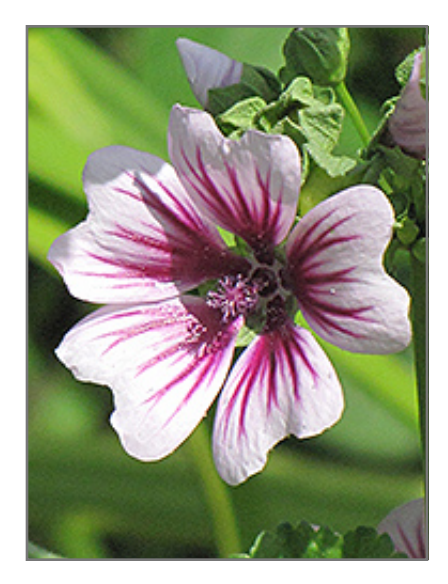
Zebrina Mallow flowers