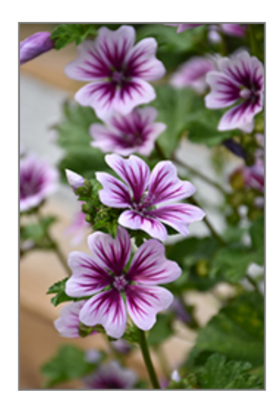
Zebrina Mallow flowers