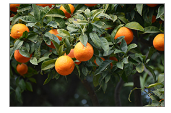
Bitter Orange fruit

Attractive deep green foliage on a dense, shrubby habit; fragrant flowers produce yellow-orange fruit that is bitter and can be used for preserves, but is primarily used in oil production; protect from frost