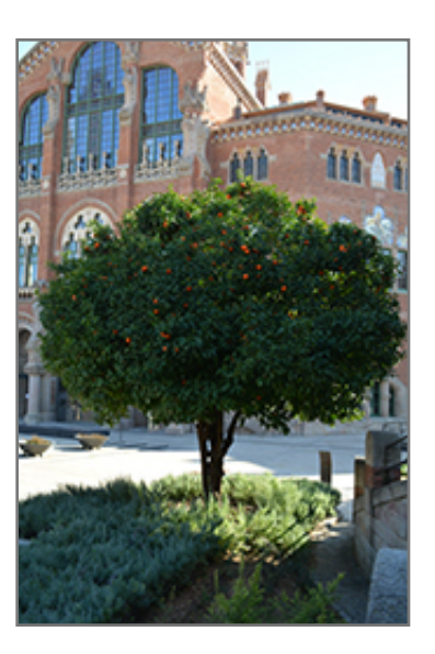
Bitter Orange fruit

Bitter Orange is a good choice for the edible garden, but it is also well-suited for use in outdoor pots and containers. Its large size and upright habit of growth lend it for use as a solitary accent, or in a composition surrounded by smaller plants around the base and those that spill over the edges. It is even sizeable enough that it can be grown alone in a suitable container. Note that when grown in a container, it may not perform exactly as indicated on the tag - this is to be expected. Also note that when growing plants in outdoor containers and baskets, they may require more frequent waterings than they would in the yard or garden. Be aware that in our climate, most plants cannot be expected to survive the winter if left in containers outdoors, and this plant is no exception. Contact our experts for more information on how to protect it over the winter months.