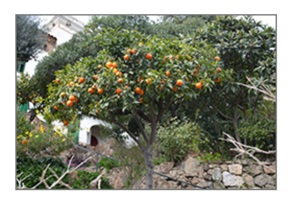
Bitter Orange fruit

Bitter Orange features showy clusters of fragrant white star-shaped flowers with buttery yellow eyes at the ends of the branches from late spring to mid summer. It has attractive dark green evergreen foliage. The glossy oval leaves are highly ornamental and remain dark green throughout the winter. It produces orange berries with yellow overtones from early to mid winter. The fruit can be messy if allowed to drop on the lawn or walkways, and may require occasional clean-up.