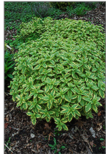
Golden Alexander Loosestrife