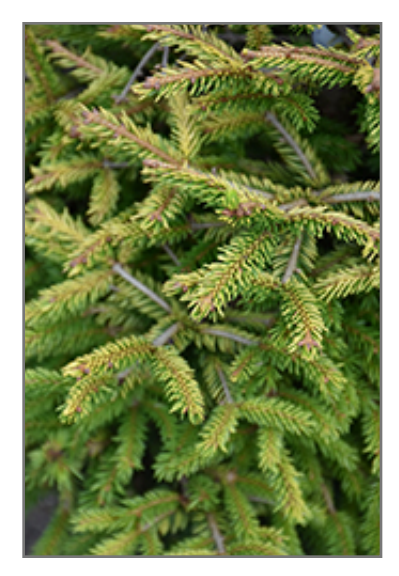
Firefly Golden Spruce foliage