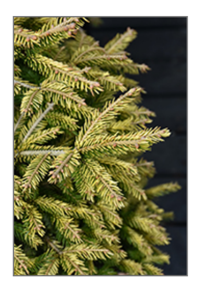
Firefly Golden Spruce foliage