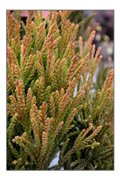
Rein's Dense Jade Japanese Cedar foliage