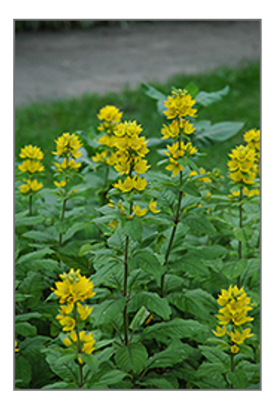
Yellow Loosestrife flowers

Yellow Loosestrife has masses of beautiful spikes of gold star-shaped flowers at the ends of the stems from late spring to early summer, which are most effective when planted in groupings. The flowers are excellent for cutting. Its pointy leaves remain green in colour throughout the season.