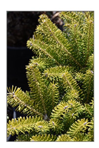
Golden Glow Korean Fir foliage

Golden Glow Korean Fir will grow to be about 6 feet tall at maturity, with a spread of 12 feet. It tends to fill out right to the ground and therefore doesn't necessarily require facer plants in front, and is suitable for planting under power lines. It grows at a slow rate, and under ideal conditions can be expected to live for 60 years or more.