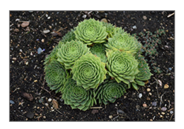
Limelight Hens And Chicks

This variety is very hardy and drought tolerant; symmetrical rosettes of chartreuse to lime green leaves with a powdery cast and pink tips; pastel pink star flowers in summer; ideal for rock gardens and containers