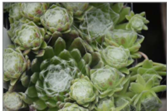
Cobweb Buttons Hens And Chicks