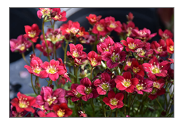
Touran Deep Red Saxifrage flowers

Touran Deep Red Saxifrage features tiny dark red star-shaped flowers with chartreuse eyes at the ends of the stems from mid spring to early summer. Its needle-like leaves remain emerald green in colour throughout the season.