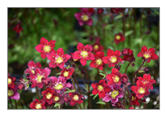
Touran Deep Red Saxifrage flowers