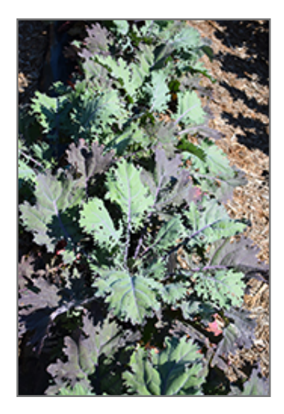
Red Russian Kale

Red Russian Kale will grow to be about 24 inches tall at maturity, with a spread of 12 inches. When planted in rows, individual plants should be spaced approximately 18 inches apart. This fast-growing vegetable plant is an annual, which means that it will grow for one season in your garden and then die after producing a crop.