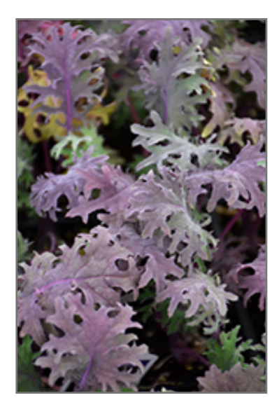
Red Russian Kale foliage