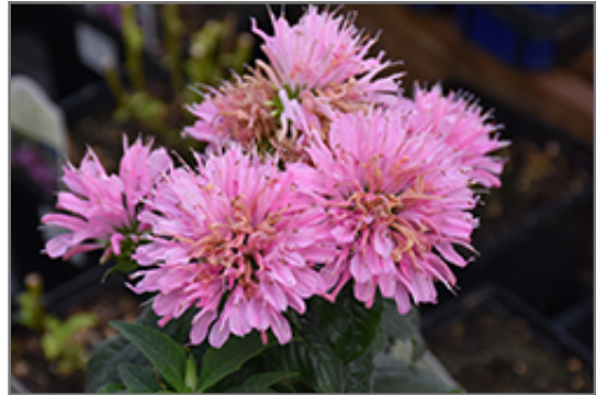
Sugar Buzz Pink Frosting Beebalm flowers

Sugar Buzz Pink Frosting Beebalm is recommended for the following landscape applications;