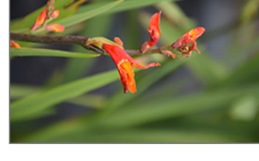
Orange Pekoe Crocosmia flowers