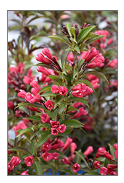
Electric Love Weigela flowers