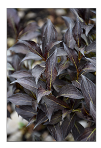
Electric Love Weigela foliage