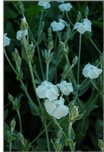
White Rose Campion flowers