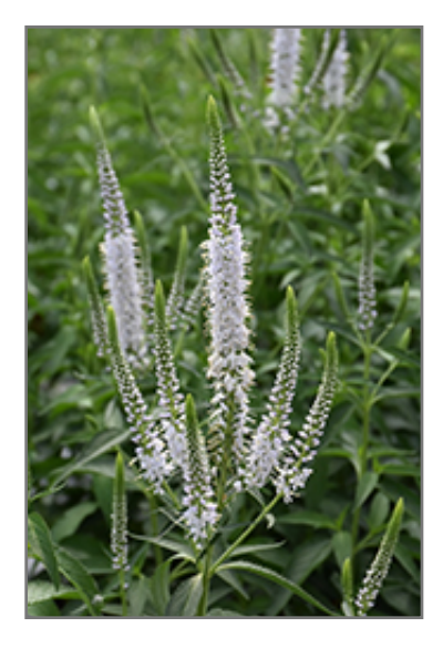
White Jolanda Speedwell flowers

An easy to grow, clump forming variety producing dense spikes of pure white flowers, towering over dark green serrated foliage; makes an ideal groundcover or edging; great in rock gardens