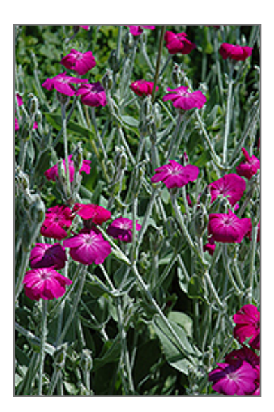
Rose Campion flowers

Rose Campion has masses of beautiful fuchsia flowers with white eyes at the ends of the stems from early to mid summer, which are most effective when planted in groupings. The flowers are excellent for cutting. Its attractive tomentose pointy leaves remain gray in colour throughout the season. The silver stems can be quite attractive.