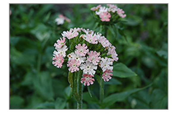
Dusky Salmon Maltese Cross flowers

Plant Height: 18 inches Flower Height: 32 inches Spread: 18 inches Spacing: 16 inches Sunlight: O Hardiness Zone: 2a