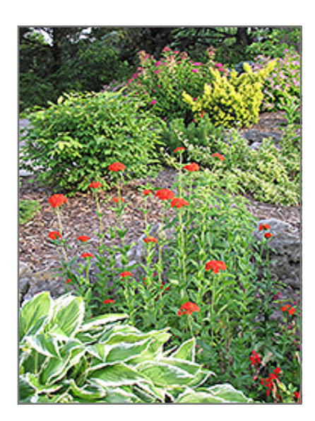
Maltese Cross in bloom