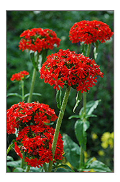
Maltese Cross flowers