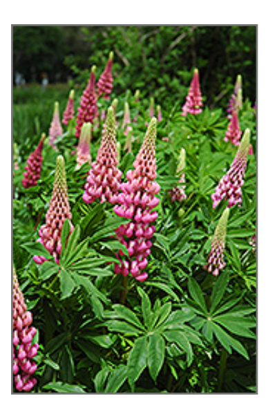
Russell Red Lupine flowers

Russell Red Lupine features bold spikes of red pea-like flowers rising above the foliage from late spring to early summer. The flowers are excellent for cutting. Its palmate leaves remain emerald green in colour throughout the season.