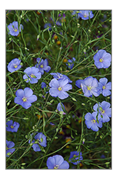
Perennial Flax flowers