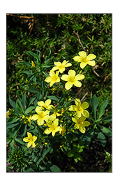
Dwarf Perennial Flax flowers

Dwarf Perennial Flax will grow to be about 12 inches tall at maturity, with a spread of 12 inches. When grown in masses or used as a bedding plant, individual plants should be spaced approximately 8 inches apart. It grows at a fast rate, and under ideal conditions can be expected to live for approximately 3 years. As an herbaceous perennial, this plant will usually die back to the crown each winter, and will regrow from the base each spring. Be careful not to disturb the crown in late winter when it may not be readily seen!