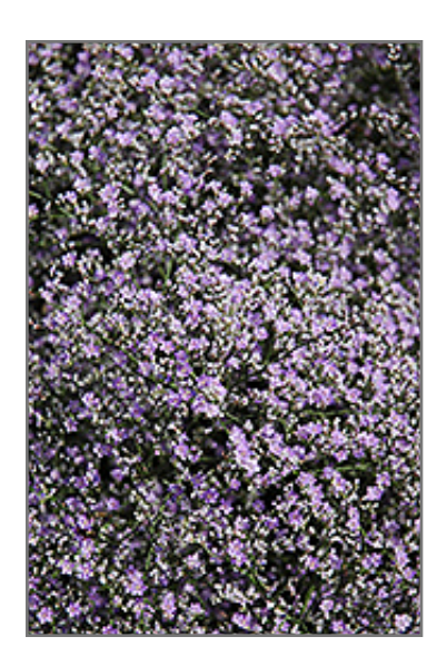
Sea Lavender flowers