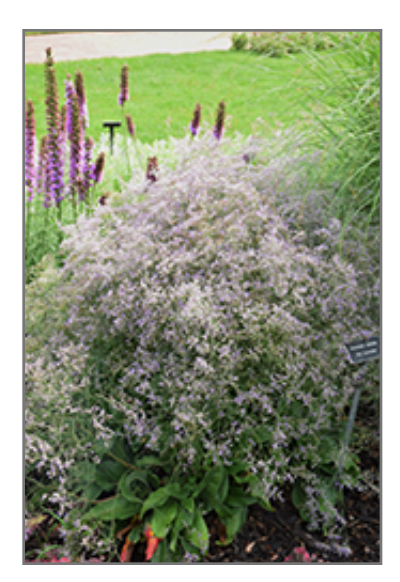
Sea Lavender in bloom