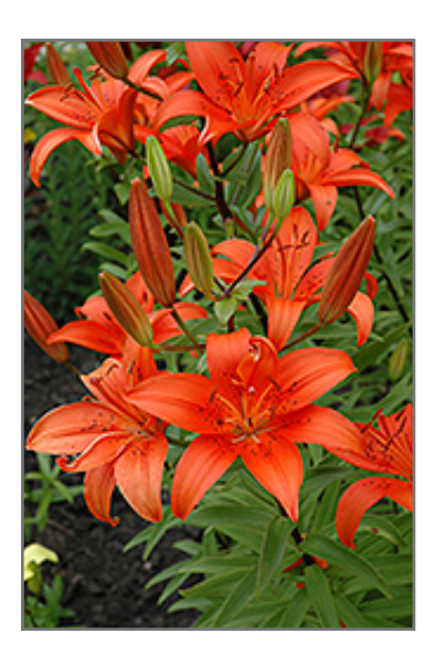
Yolanda Lily flowers

Yolanda Lily features bold tomato-orange trumpet-shaped flowers with brown spots at the ends of the stems in early summer. The flowers are excellent for cutting. Its narrow leaves remain green in colour throughout the season.