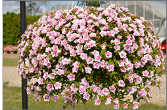
MiniFamous Uno Double PinkTastic Calibrachoa in bloom