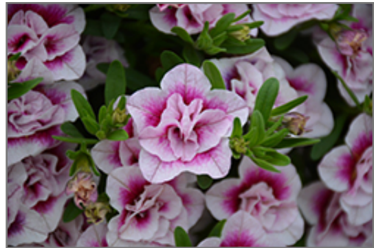
MiniFamous Uno Double PinkTastic Calibrachoa flowers

MiniFamous Uno Double PinkTastic Calibrachoa is a dense herbaceous annual with a trailing habit of growth, eventually spilling over the edges of hanging baskets and containers. Its medium texture blends into the garden, but can always be balanced by a couple of finer or coarser plants for an effective composition.