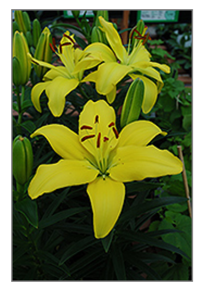
Yellow Pixie Lily flowers

Yellow Pixie Lily features bold yellow trumpet-shaped flowers with brown anthers at the ends of the stems in early summer. The flowers are excellent for cutting. Its narrow leaves remain green in colour throughout the season.