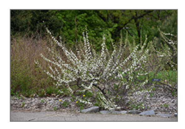
Sandcherry in bloom