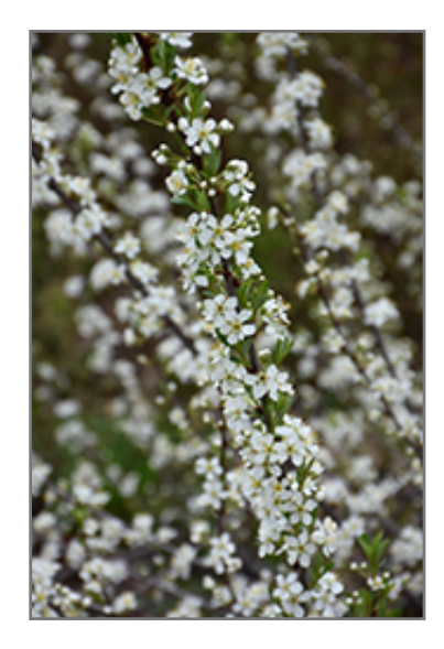
Sandcherry flowers

This is a relatively low maintenance shrub, and is best pruned in late winter once the threat of extreme cold has passed. It has no significant negative characteristics.