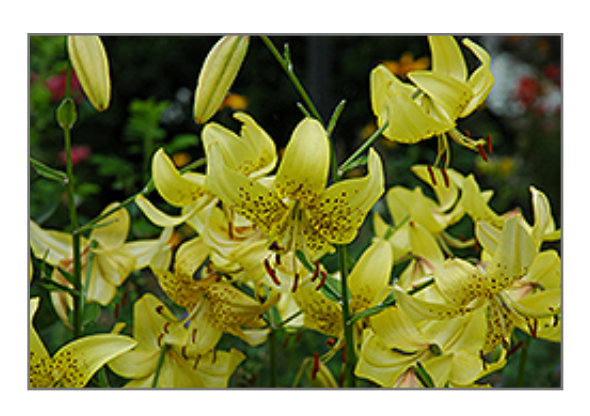
Sutton's Gold Lily flowers