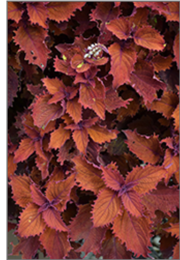
ColorBlaze Wicked Hot Coleus foliage