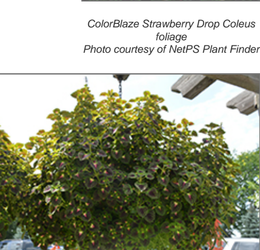
ColorBlaze Strawberry Drop Coleus

This is a relatively low maintenance plant. The flowers of this plant may actually detract from its ornamental features, so they can be removed as they appear. Deer don't particularly care for this plant and will usually leave it alone in favor of tastier treats. It has no significant negative characteristics.