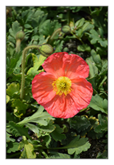
Champagne Bubbles Pink Poppy flowers

A clump-forming self-seeding selection offering a display of color, with large plate-like pink flowers on strong stems; very pretty, with a long-lasting garden performance