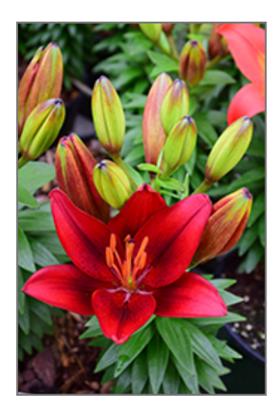
Lily Looks Tiny Rocket Lily flowers

Lily Looks Tiny Rocket Lily is recommended for the following landscape applications;