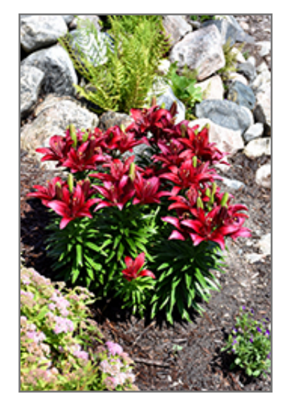
Lily Looks Tiny Rocket Lily in bloom