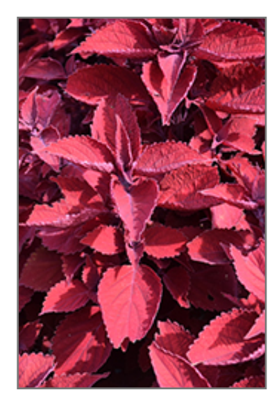
Beale Street Coleus foliage

This is a relatively low maintenance plant. The flowers of this plant may actually detract from its ornamental features, so they can be removed as they appear. Deer don't particularly care for this plant and will usually leave it alone in favor of tastier treats. It has no significant negative characteristics.