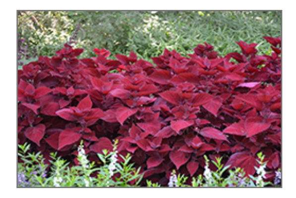
Beale Street Coleus

Beale Street Coleus is recommended for the following landscape applications;