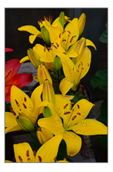
Golden Matrix Lily flowers

A brilliant dwarf lily featuring sunny golden yellow blooms with dark speckles, creating a memorable impact in the garden; a perfect choice to mass, and create a striking focal point in borders; great for planters because of shorter plant height