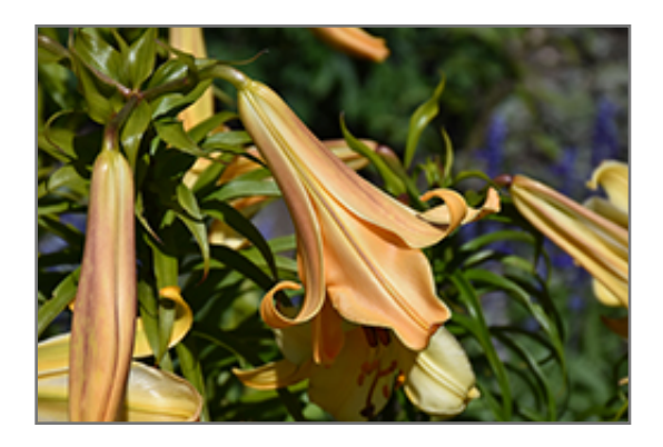
African Queen Lily flowers

African Queen Lily is an herbaceous perennial with a rigidly upright and towering form. Its medium texture blends into the garden, but can always be balanced by a couple of finer or coarser plants for an effective composition.