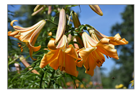
African Queen Lily flowers