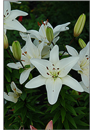
Snow Storm Lily flowers