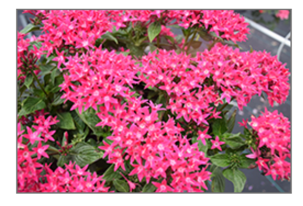
Sunstar Rose Egyptian Star Flower flowers