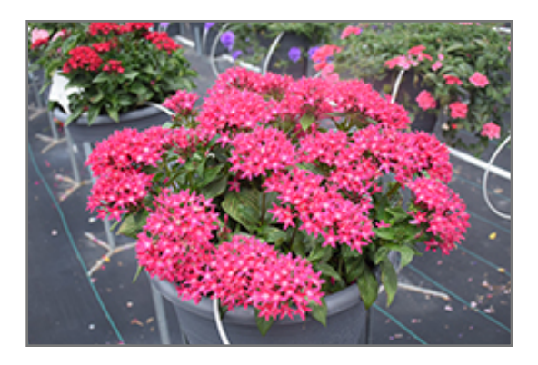
Sunstar Rose Egyptian Star Flower in bloom

Sunstar Rose Egyptian Star Flower is an herbaceous annual with an upright spreading habit of growth. Its relatively coarse texture can be used to stand it apart from other garden plants with finer foliage.