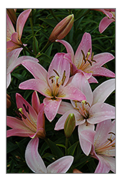
Showbiz Lily flowers

Showbiz Lily features bold shell pink trumpet-shaped flowers with yellow throats and purple tips at the ends of the stems in early summer. The flowers are excellent for cutting. Its narrow leaves remain green in colour throughout the season.