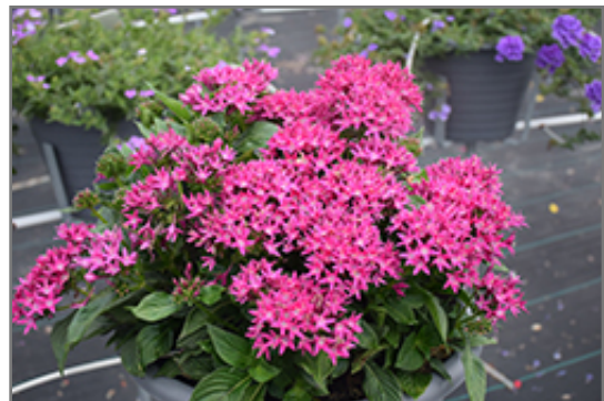
Sunstar Lavender Egyptian Star Flower in bloom